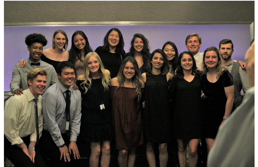
2016-2017 Executive Board