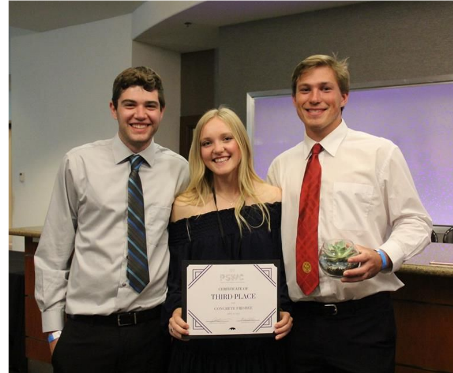
Concrete Frisbee Team Celebrates at PSWC 2017

Unfortunately, this goal was not met in 2017. Although we were able to place 3rd in Concrete Frisbee, we did not do as well as we hoped to in other categories. Our priority moving forward is to not only focus on the core design teams but to place more emphasis on teams like Design-Build, Geotech, Surveying, and Transportation. We think that this strategy will lead us back to top 5 as we have performed in previous years.