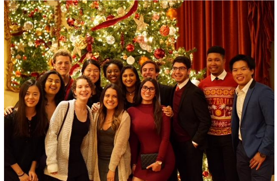
ASCE E-board members at the 2017 annual Civil Engineering Department holiday party

The goal was met by (1) planning more social events in general, not restricting the events to USC ASCE activities and (2) having the design team captains plan joint events for the design teams. This year we developed strong relationships between our members by joining the USC Intramural Basketball League, attending the annual holiday party, hiking and even bowling. There were a total of 10 social events in 2016. In 2017 we aimed for the same amount and wound up with 13 socials .