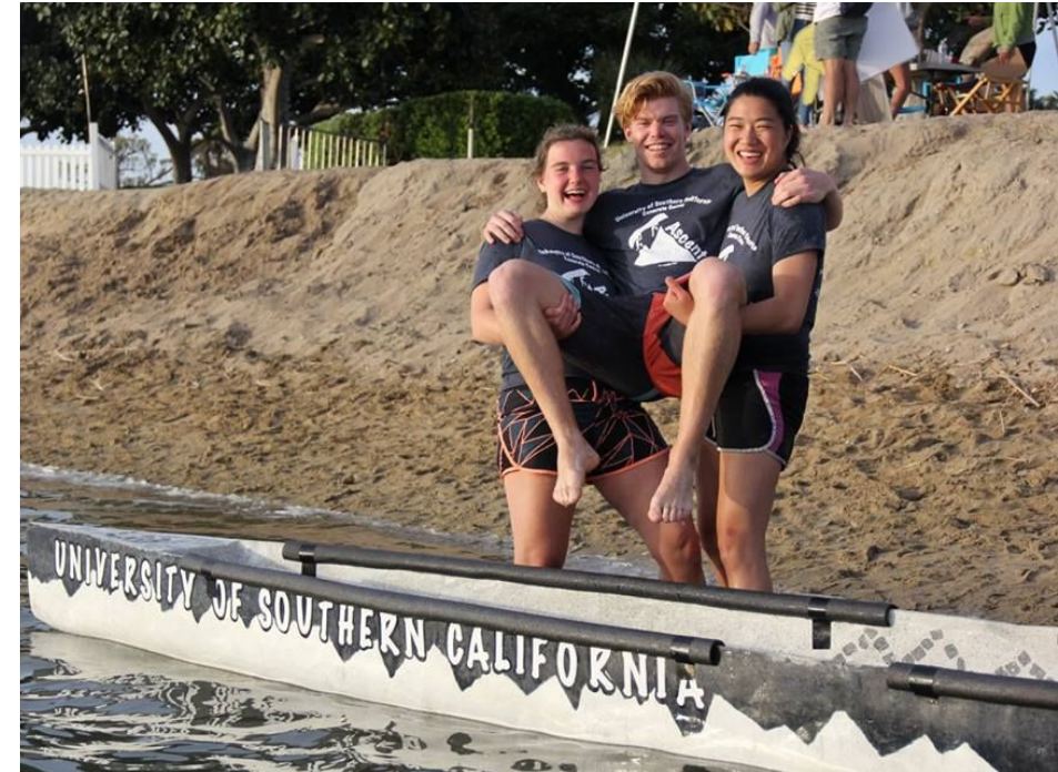
2016-2017 Concrete Canoe Captains