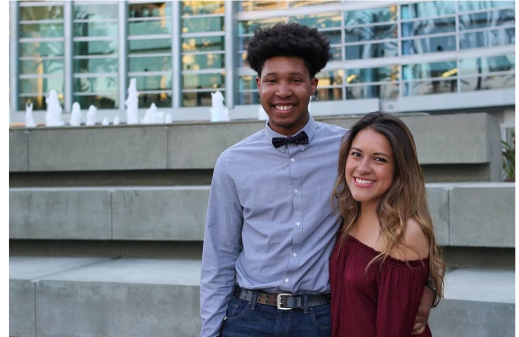
2017-2018 Steel Bridge Captains