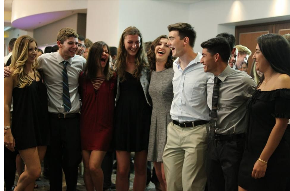
7 of our freshman members at PSWC 2017

Underclassmen involvement improved from 26 student members in 2016 to 31 student members in 2017 . The goal was met by maintaining the Big Buddy program and participating in involvement fairs. Our increase in membership is also attributed to our underclassmen officers making announcements in introductory civil engineering courses.