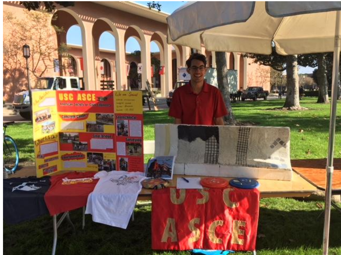
ASCE Executive Board present our work at the Viterbi and General Student Involvement Fairs