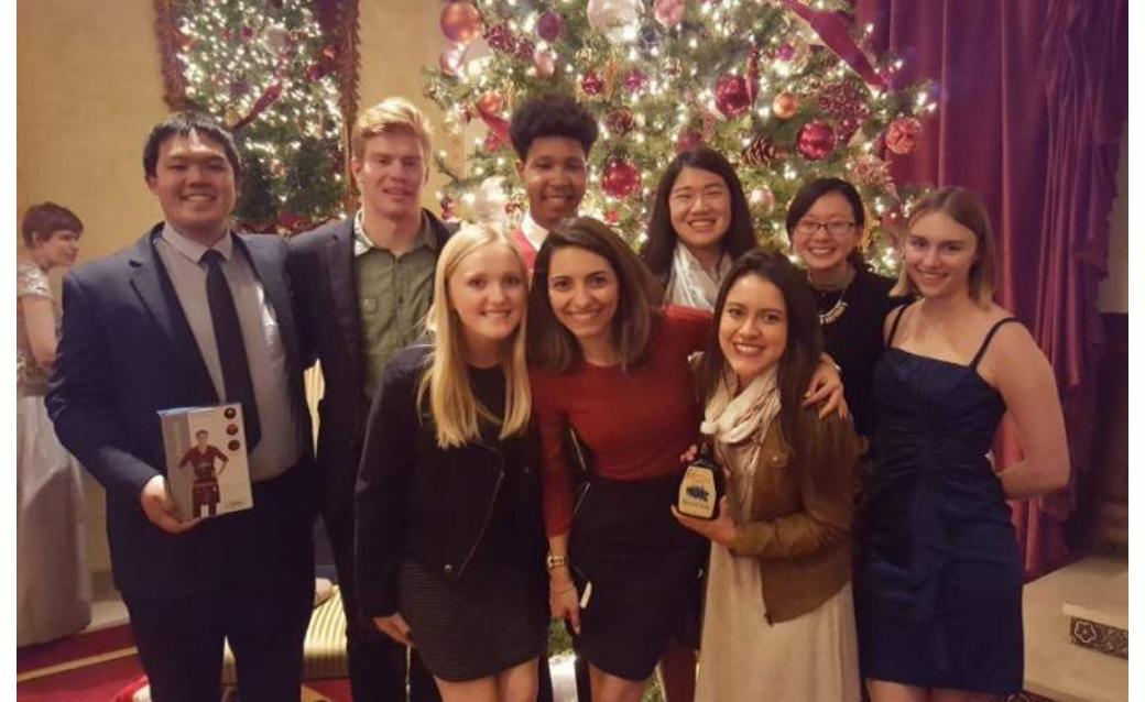
ASCE E-board members at the 2016 annual holiday party

The goal was met by planning to appoint more social events whether it be USC ASCE related or not. We recognized it was vital to build a connection between members so holiday parties, visiting the neighboring science museum, and even hiking were some instigated events. There were 5 social events in 2015 . We aimed to have 10 social events in 2016 and ended up achieving exactly 10 socials in 2016 .