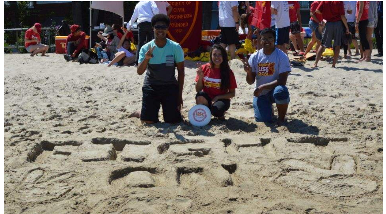
3 of our freshman members at PSWC 2016

Underclassmen involvement improved from 21 student members in 2015 to 26 student members in 2016 . The goal was met by maintaining the Big Buddy program and recruiting students by participating in involvement fairs and making announcements in introductory civil engineering courses.