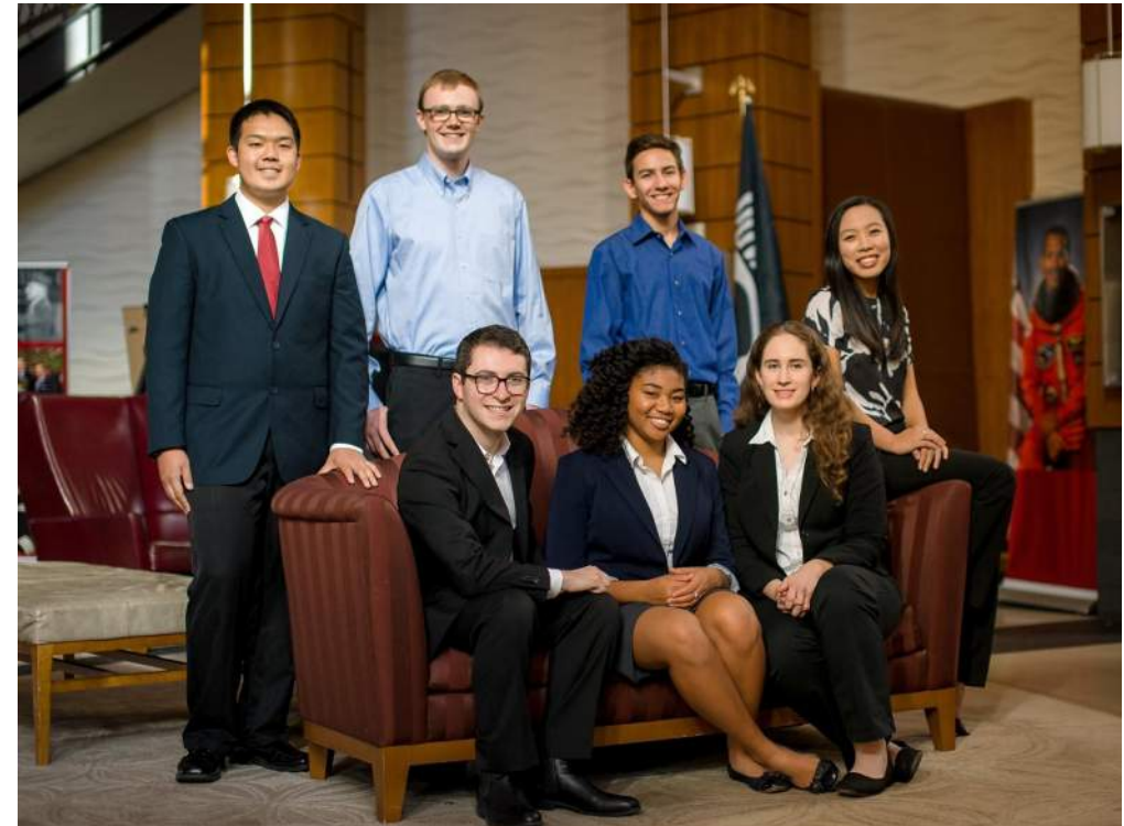
Members of 2015-2016 Executive Board