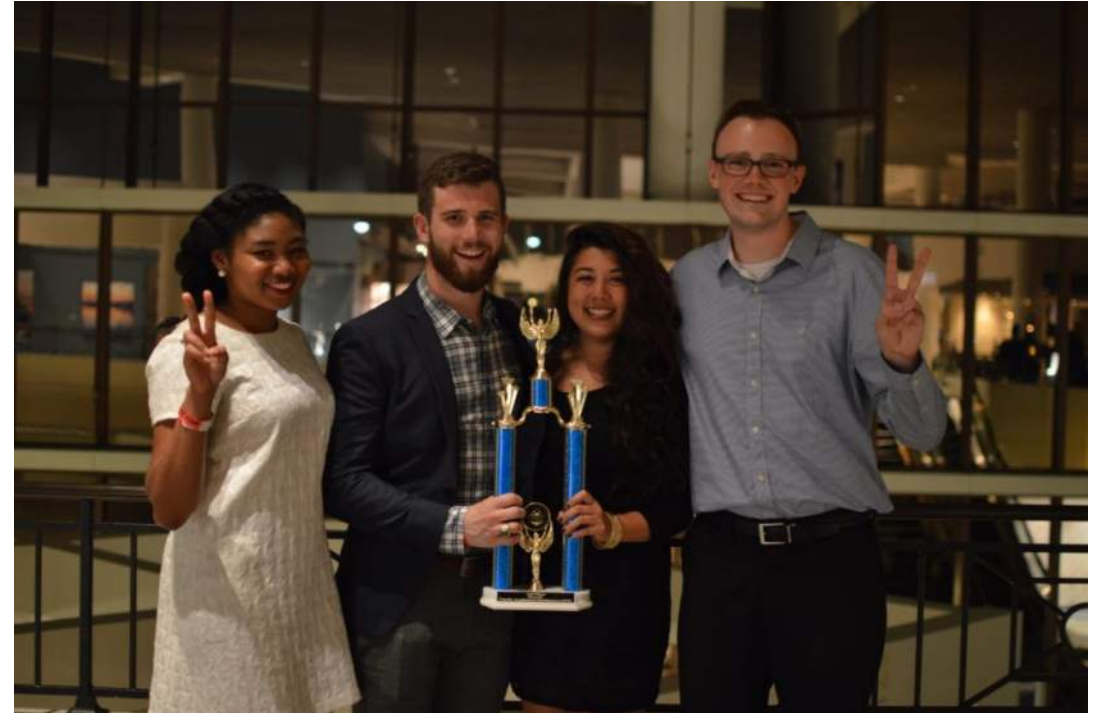
E-board members with the 3rd place PSWC trophy

The goal was met by aiming to stay on top of our most critical design teams. Meetings for steel bridge, concrete canoe, and environmental teams were held weekly if not more. The priority was to progress forward and really focus on bettering the teams. In 2015 we placed 3rd and our goal for next year in 2016 was to again reach the top 5. In 2016 we also achieved 3rd place and made it to our target goal.