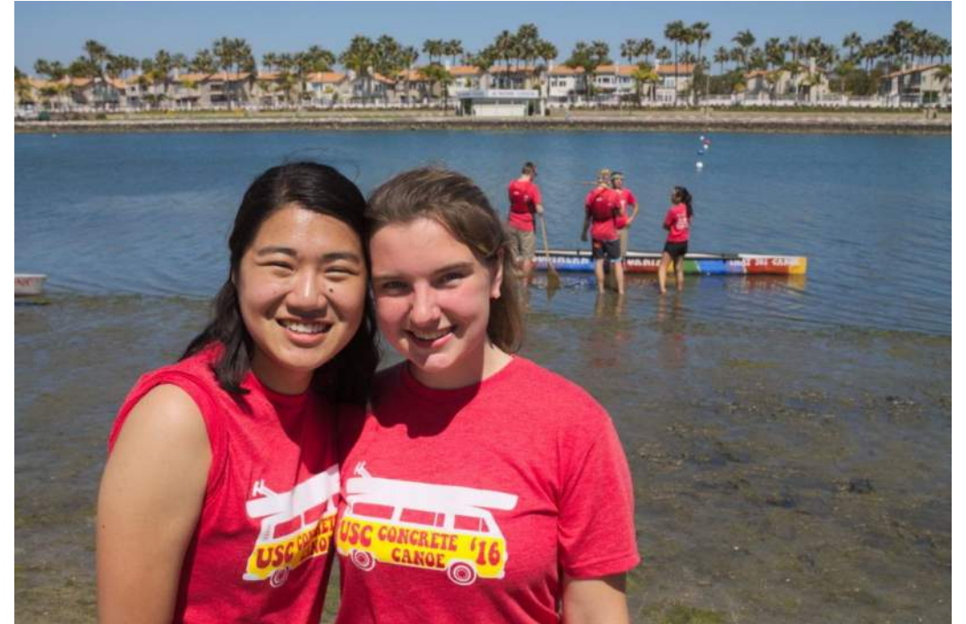
Two of the 2016-2017 Concrete Canoe Captains