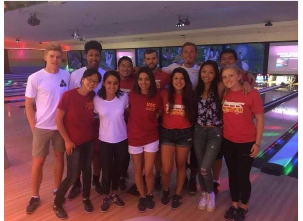
2016-2017 Fall Eboard Retreat