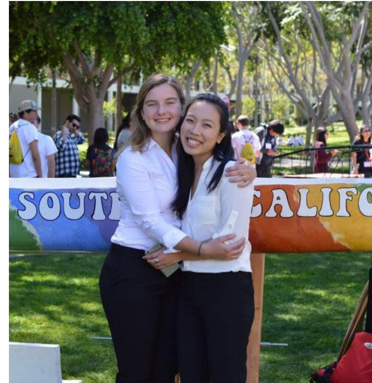
2015-2016 Concrete Canoe Captains